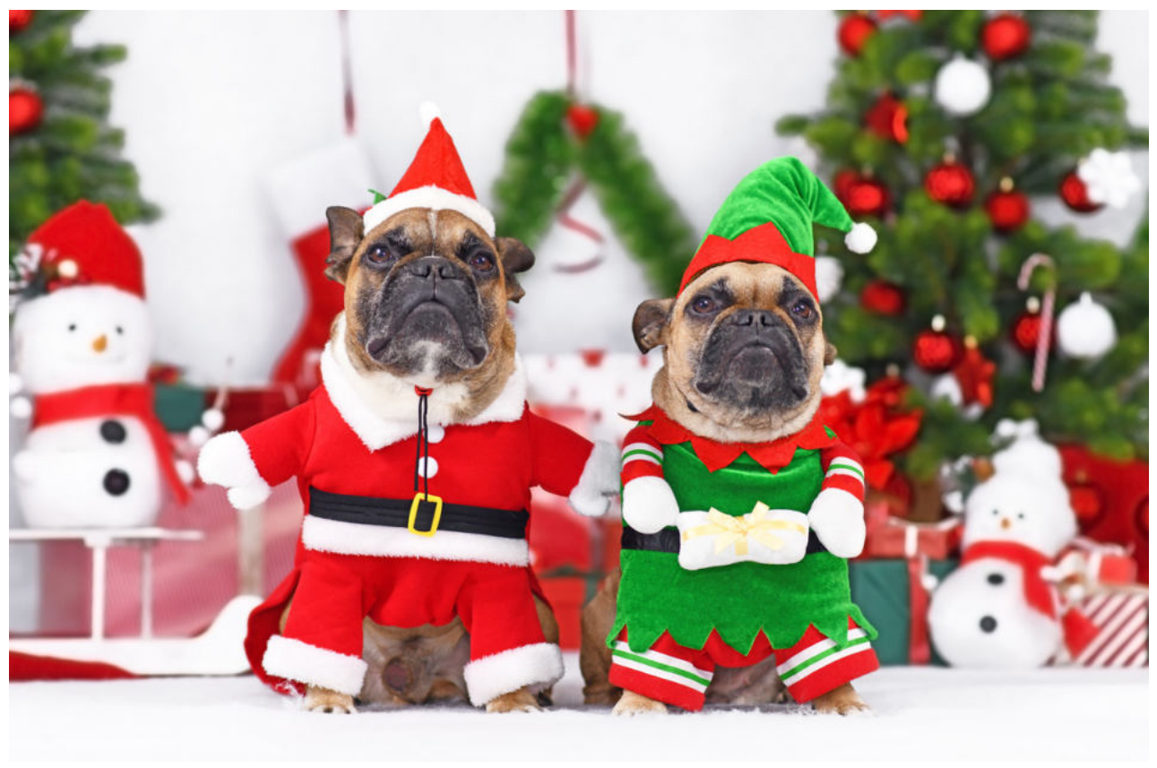
HAVE A LOVELY CHRISTMAS BREAK FROM ALL OF US AT BISHOP RAWSTORNE!